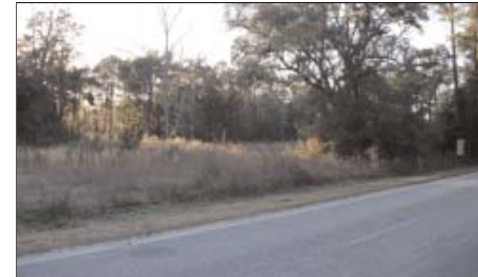
One of many original Macklen Ave. parcels